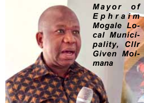
Mayor of Ephraim Mogale Local Municipality, Cllr Given Moimana

“We are going to decentralise the economy of Ephraim Mogale to reach every village and by so doing, we would be improving the living conditions of our people,” said Moimana. He encouraged residents to take part in building the municipality in order to confront the triple challenges: poverty, unemployment and inequality that are facing the country today.