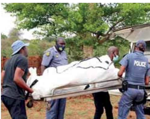
The police seek the public to help identify the body of a man that was retrieved from Lepelle River.