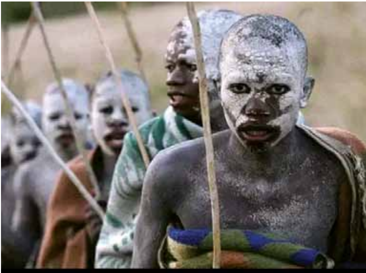
The Hlogotlou Police and the Limpopo COGHSTA closed down an illegal initiation school in Kutupu Village.