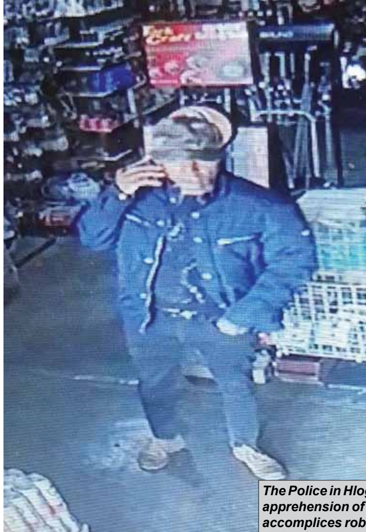
The Police in Hlogotlou appeal to the public to assist in the apprehension of the picture suspect who along with three accomplices robbed a hardware store in Sephaku Village.

to anyone with information that can assist in the apprehension of the suspects and whoever can be able to recognise the person on the picture to please contact Detective Sergeant Thekupi at 082 775 5462, alternatively report to the nearest police station or to crime stop number 08600 10111 and can also send information through MysapsApp. Police investigations are continuing," he said.