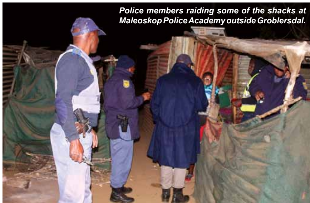
Police members raiding some of the shacks at Maleoskop Police Academy outside Groblersdal.